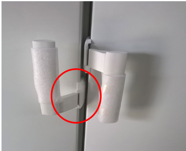
Then do the second handle on the appliance on the left