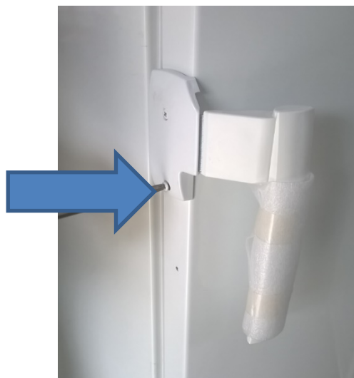
Example of a quick release handle

Side-by-side installations using spare parts: