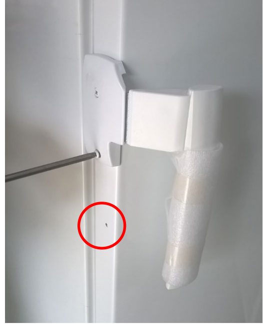
Fix the second screw and cover the original hole with the plastic pin in the kit.