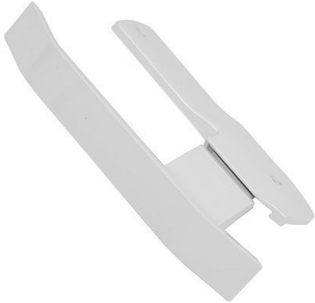
2651051100 White and silver Fridge / Freezer Door Handle