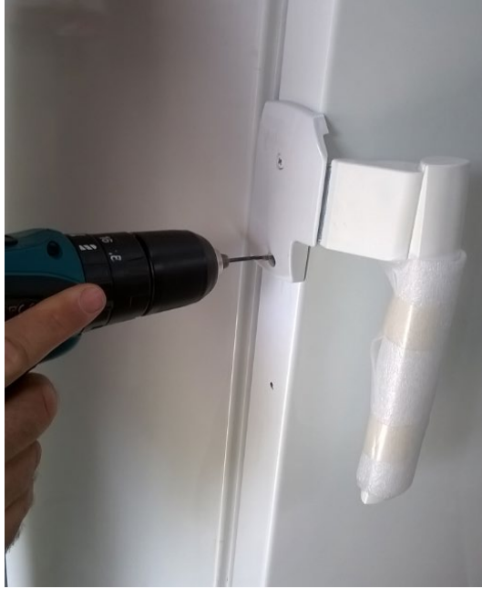
4. Drill a new hole in for the lower fastening.