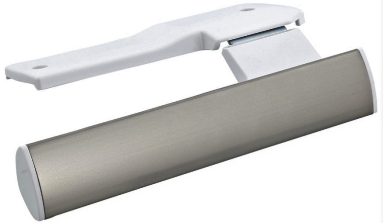
2083903142 White Freezer Vertical Door Handle Assembly – side-by-side installations