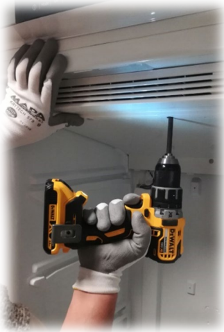
5. Remove the cold module