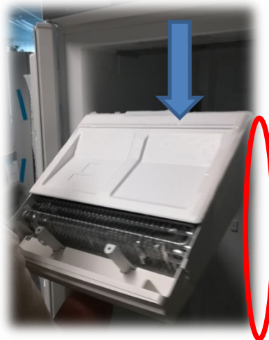
Be careful of the suction tube