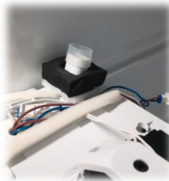
7. Fit the new sealing sponge and refit the silicon tube