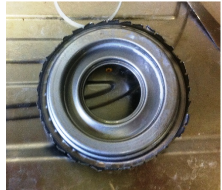
Result after the use of the cleaner

These easy actions should prevent repetitive calls due to limescale on the heater. Moreover, it is a preventive action for service visits caused by other reasons.