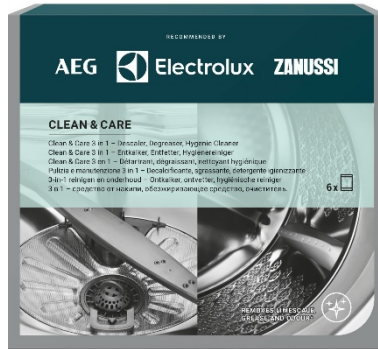
CLEAN AND CARE Part number: 9029799187