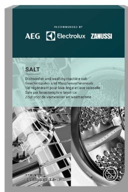
SALT FOR DISWASHERS Part number: 9029799278