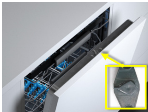
Diamond door lock

At the current dishwashers that have the “diamond” door lock with auto door opening it is possible to bend Upper Front Crossbar by inproper handing, transportation or installation to the position where Door Lock’s hooks and Diamond will be out of horizontal alignment: