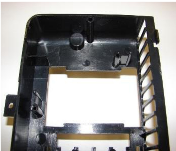
Current part – C/P Moulding

Important: All old parts must be replaced together as the old C/P moulding has been changed to accommodate the new PWB Assembly. The Power Unit & CPU Assembly will now be supplied hardwired together and will become one component instead of the previous two. For every replacement PWB Assembly required a new style C/P Moulding will have to be ordered as well. (See details below)