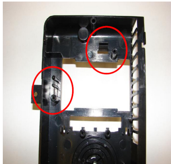
New Part – C/P Moulding

Red Circles highlight areas of modification to retain the new PWB Assembly.