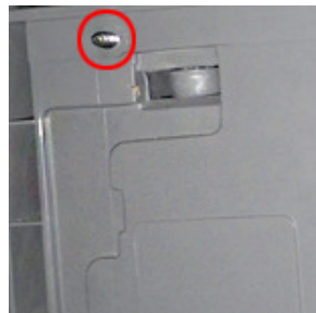
Use of additional screws - example

IMPORTANT: Improper mounting of the panel voids the warranty.