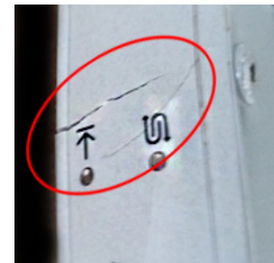
Cracks on front panel display area – examples.