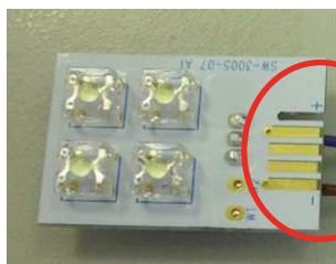
Contacts of the old lighting platine

Caused by condensation water the lighting platine can be short-circuited. Under this circumstance, the lighting does not switch off, but the electronic device displays the warning "Open fridge door". This reaction is depending on the fridge model. A short-term solution could be a dehumidification of the platine (please see pictures below). Finally the lighting platine must be exchanged.