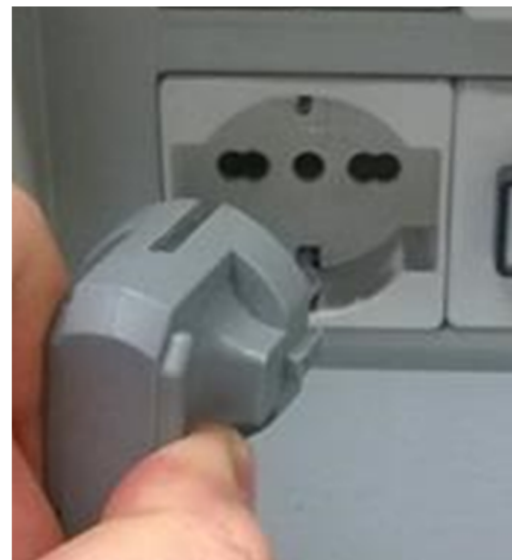
2. Unplug the power cord.