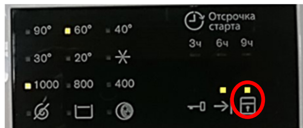
Active 'Child Lock' function notification.