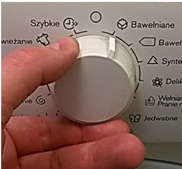
1. Set the selector knob to any position except OFF. EN SDT - KL

ATTENTION!: It is not necessary to exchange any parts or reprogram the washing machine.