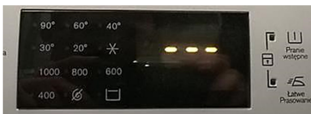
Three dashes on display.

Problem can occur when the washing machine finished the program while the 'CHILD LOCK' function has been active and then washing machine was switched off using the selector and power cord was unplugged or there were voltage dropouts. When the washing machine is turned on three dashes on the display can appear.