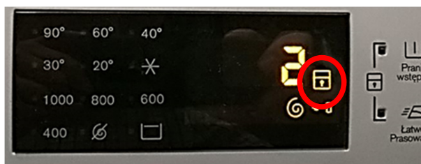
Active 'Child Lock' function notification.