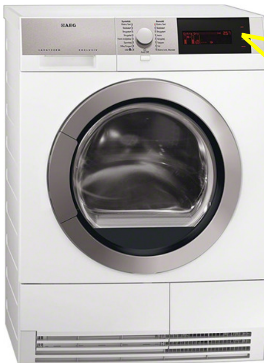
Normal operation mode

In Tumble Dryer HP2C series 9N alarm code E90 may be displayed in normal operation mode. In diagnostic mode alarm code can change to E9E. This may occur in appliances with serial number up to 310xxxxx. In case of user interface board malfunction, message “Not possible” is displayed during drying cycle.