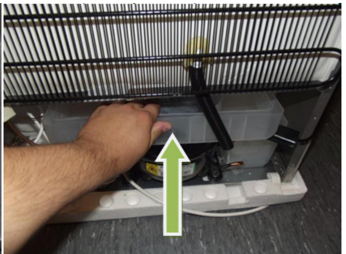
4. Put the evaporation tray back on compressor. Corner above additional drip tray should be slightly lower than other ones.