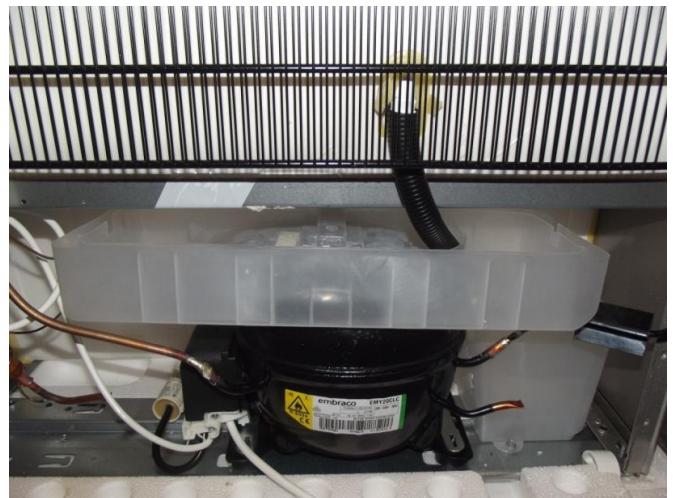
6. Correct placement of evaporation tray and drain tube.