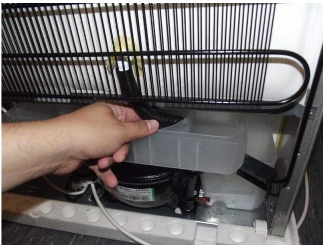
5. Place drain tube back in evaporation tray. Must be positioned to right side.