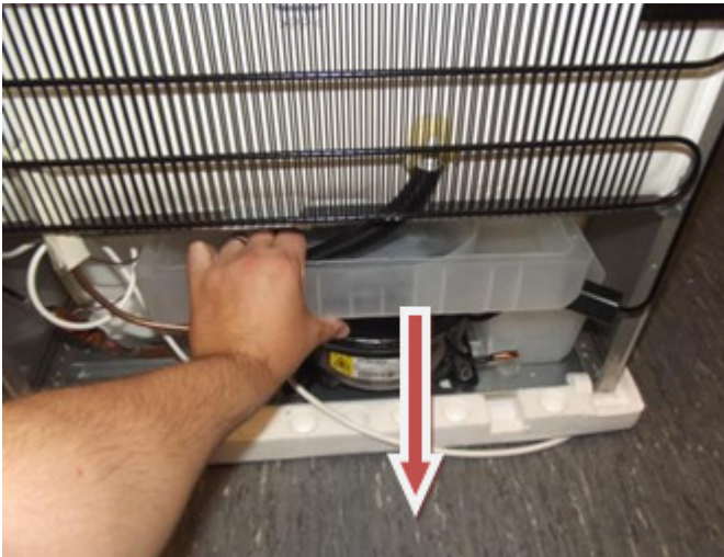
1. Remove compressor evaporation tray.

To correct compressor evaporation tray follow below instructions: