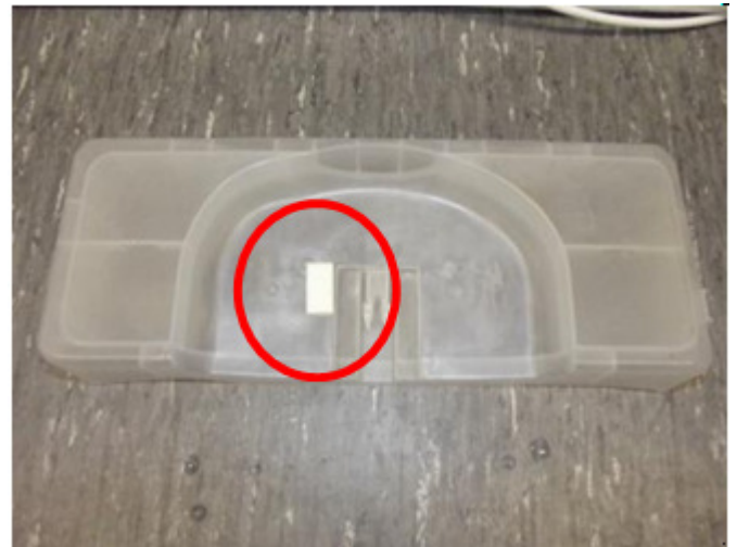
2. Place adhesive sponge in indicated area.