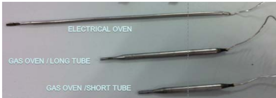
CAPILLARY TUBES FOR THERMOSTATS (NO CHANGE)