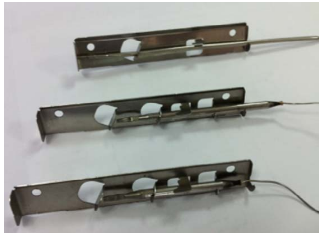
CAPILLARY TUBES PLACED ON THE NEW HOLDERS

Thermostat holder is well fixed on the cavity so that the stability of the thermostat bulb position is guaranteed (even in the condition of vibration/ impact or etc..) and thus the thermostat sensibility will be guaranteed.