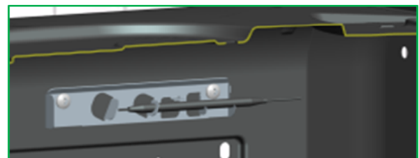
New thermostat holder for gas oven 4055174066