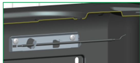
New thermostat holder for electric oven 4055174074