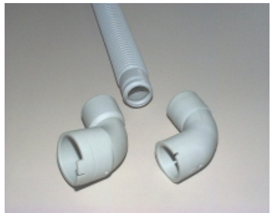
If necessary, you should reuse the angular bush from the old discharge hose.

As all the regenerating distributors do not have connection pieces for the ventilation hose, customer service may install the ventilation hose in other than standard ways. As the figure shows, the ventilation hose is installed, on the one hand, up to upper edge of the machine and then into the base trough. Although the ball valve at the beginning of the ventilation hose might not close perfectly, no water will penetrate into the base trough, even if the machine is installed in height.