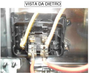
Fissaggio su foro per vite diam 4.2 autofilettante sul component carrier